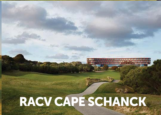
RACV CAPE SCHANCK

Play 4 magnificent Mornington Peninsula Courses in this prestigious individual stableford tournament