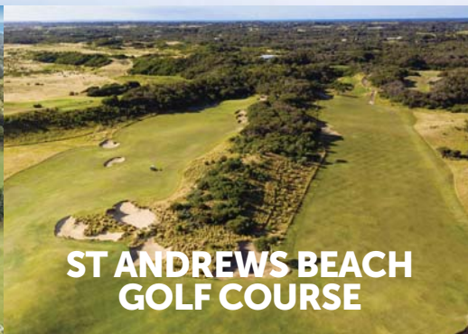
ST ANDREWS BEACH GOLF COURSE