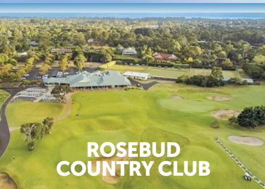
ROSEBUD COUNTRY CLUB